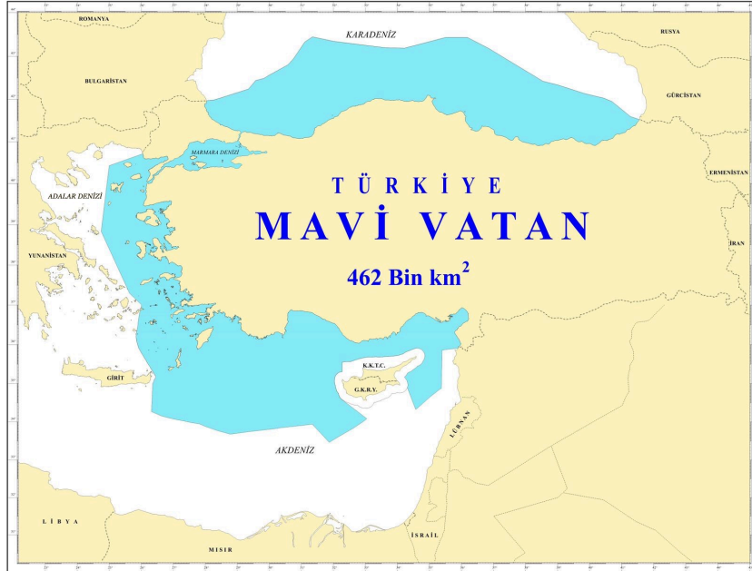
The Map of the Blue Homeland, by Major General Cihat Yaycı https://upload.wikimedia.org/wikipedia/commons/3/34/Mavi_Vatan.jpg

The map drawn by Cihat Yaycı is nothing less than the delegates should strive to reach via debates, negotiations and efforts to defend aerially and navally. 84