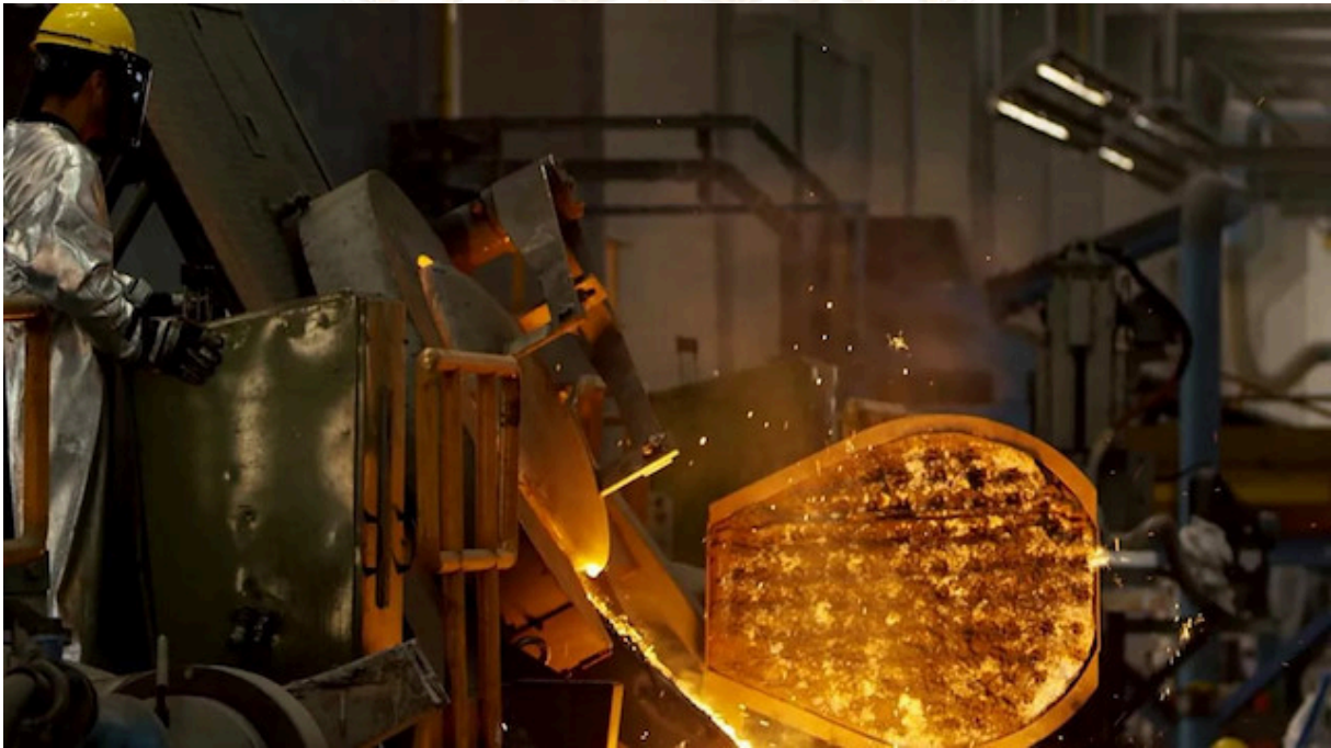
Raw material produced using advanced technology enhances armored vehicles' robustness.

https://www.yenisafak.com/foto-galeri/ekonomi/iki-bin-derecede-bile-erimiyor-turkiyede-uretiliyor-dunya-bu-ham-maddenin-pesinde-20662