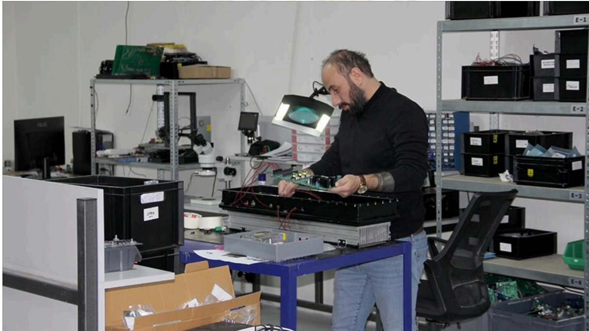
A company in Kayseri is producing batteries for the defense industry and other sectors by benefiting from TÜBİTAK's entrepreneurship Support Program.

Under the Entrepreneurship component, the establishment of a platform covering all stages from idea to maturity has been planned. The platform will activate the entrepreneurship ecosystem and increase the number of entrepreneurs. This platform also gathers entrepreneurship information, investor promotions, support summaries, education content, and sectoral developments. Additionally, the development of dual-sided support programs to increase technology suppliers' and entrepreneurs' capacities and to bring together industrialists with new products and services is aimed at 18 .