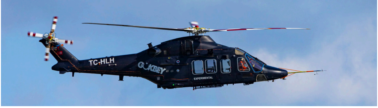
T625 GÖKBAY General Purpose Helicopter:

https://www.defenceturk.net/t625-gokbey-genel-maksat-helikopteri