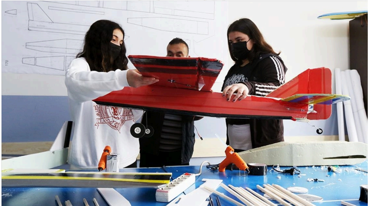
DENEYAP Technology Workshops are spreading across Türkiye.

Lastly, under the Infrastructure component, cooperation with related establishments for the creation of gigabit/sn speed data communication infrastructure is planned. They are planned to be created in industry and technology development zones, universities, research centers, and living spaces. Also, the Presidency Digital Transformation Office aims to create a public data pool collected by public institutions and make it accessible to the public.