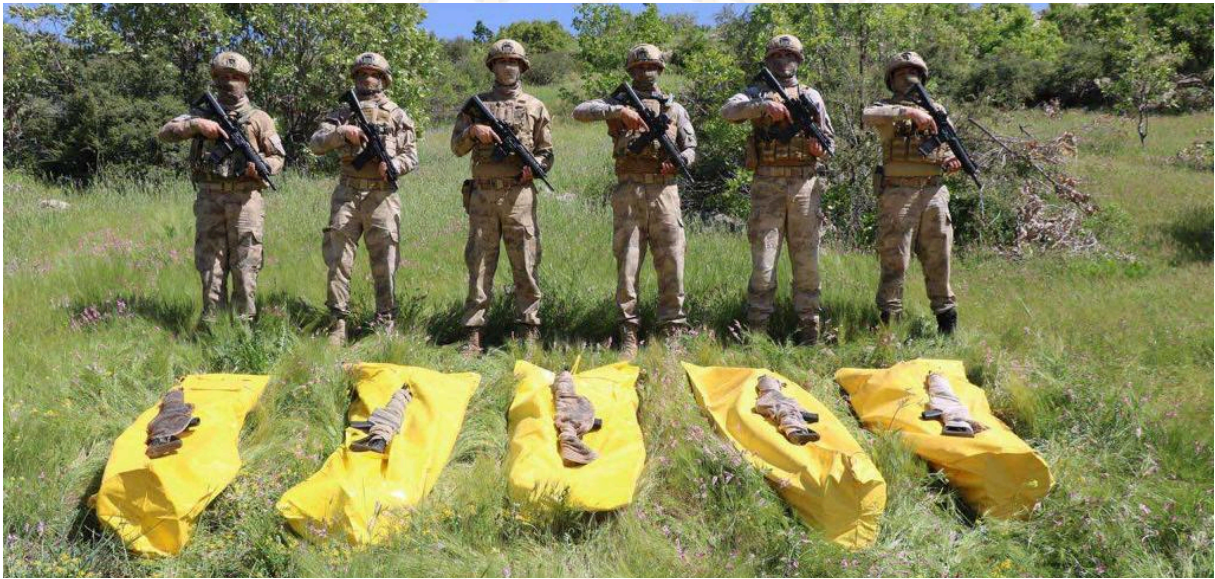
5 terrorists 'neutralized' by the Turkish Armed Forces in Northern Iraq, a contribution to regional peace. https://www.aa.com.tr/en/middle-east/turkiye-neutralizes-5-pkk-terrorists-in-northern-iraq/2951866

Within MTH's reach, the Industry's concentration of domestic and indigenous production militarily, economically, and strategically contributes to Türkiye greatly. Especially, providing for Türkiye's increasing defense and security necessities due to its geographical location, enhancing its military capacity, and ensuring national security are among top priorities. Türkiye is a significant geopolitical center of gravity on both regional and global scales. Therefore, political and economic instabilities, conflicts, and security concerns directly affect it. Herein, high-technology domestic and indigenous tools and equipment created in the defense industry provide for Türkiye's security requirements by increasing TSK's capabilities. Also, these developments contribute to regional security and peace by strengthening Türkiye's role as a regional leader.