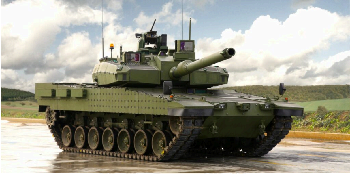
Altay Main Battle Tank.

MTH is a strategy that focuses on developing domestic and indigenous technologies without external dependency. This strategy encompasses both developing available technologies and strengthening the Industry with innovative and original solutions. In line with this, large investments are being made to realize R&D projects. Simultaneously, advanced technologies are being integrated into production processes via technology transfer 28 .