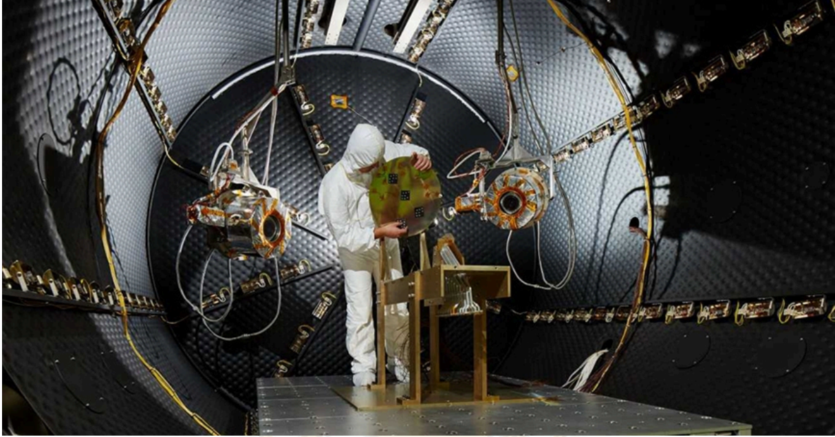
ASELSAN has accelerated its work on satellite technologies in line with Türkiye's recent space roadmap. https://www.aa.com.tr/tr/bilim-teknoloji/aselsanin-gozu-uzayda/2788621

MTH is a development movement that incentivizes domestic and national technology production by reducing foreign dependence on technology. This move seeks to eradicate foreign dependence by developing its own technologies in sectors such as defense, industry, energy, and space. Through this, it aims to position Türkiye as a competitive actor in the global technology market. In this context, MTH is defined as a vision to ensure Türkiye's economic and technological independence. And as an effort to elevate the capacity to design, develop, and produce critical technologies and products with national means to the highest level 9 .