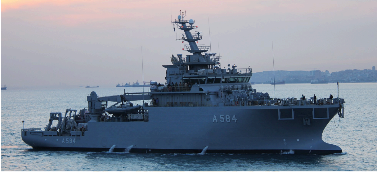
TCG İŞİN, manufactured under the Rescue and Backup Hulls Project. https://mavivatan.net/isin-sinifi-kurtarma-ve-yedekleme-gemileri/

of the Industry. One of MTH's main goals is rendering Türkiye able to produce and develop all necessary products for its national security without foreign dependence. In this context, the Industry is among the principal application fields of the MTH 23 . As a matter of fact, the indigenoussness rate in the Industry was 20% in 2002. Today, through MTH initiatives based on domestic and national production, it has surpassed 80% 24 . With this indigenoussness rate, the Industry's ability to produce high-technology defense utilities and systems increased. Therefore, Türkiye's foreign dependency was reduced by decreasing its import items.